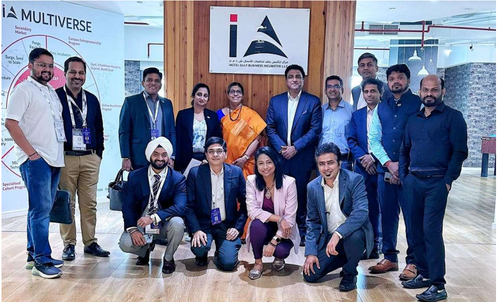
CII Startup delegation at iAccel Gulf Business Incubator, Business Village, Dubai

He also highlighted the requirements for startups / founders via an ecosystem that provides critical support including fund-raise, market access, mentorship, infrastructure, etc., iAccel is keen to collaborate closely with CII, for the global expansion of Indian SMEs/startups. http://www.iagbi.com/